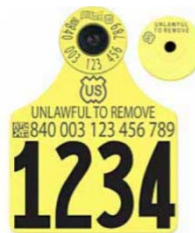
USDA 840 EID Tag With matching visual tag