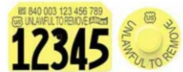
USDA 840 Tag