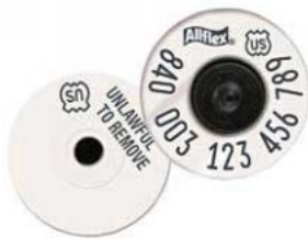
USDA 840 EID Tag

MDARD recommends that exhibitors purchase USDA 840 electronic identification (EID) tags for use in their exhibition pigs. If they choose, fairs or exhibitions can purchase an EID tag reader to use during their event.